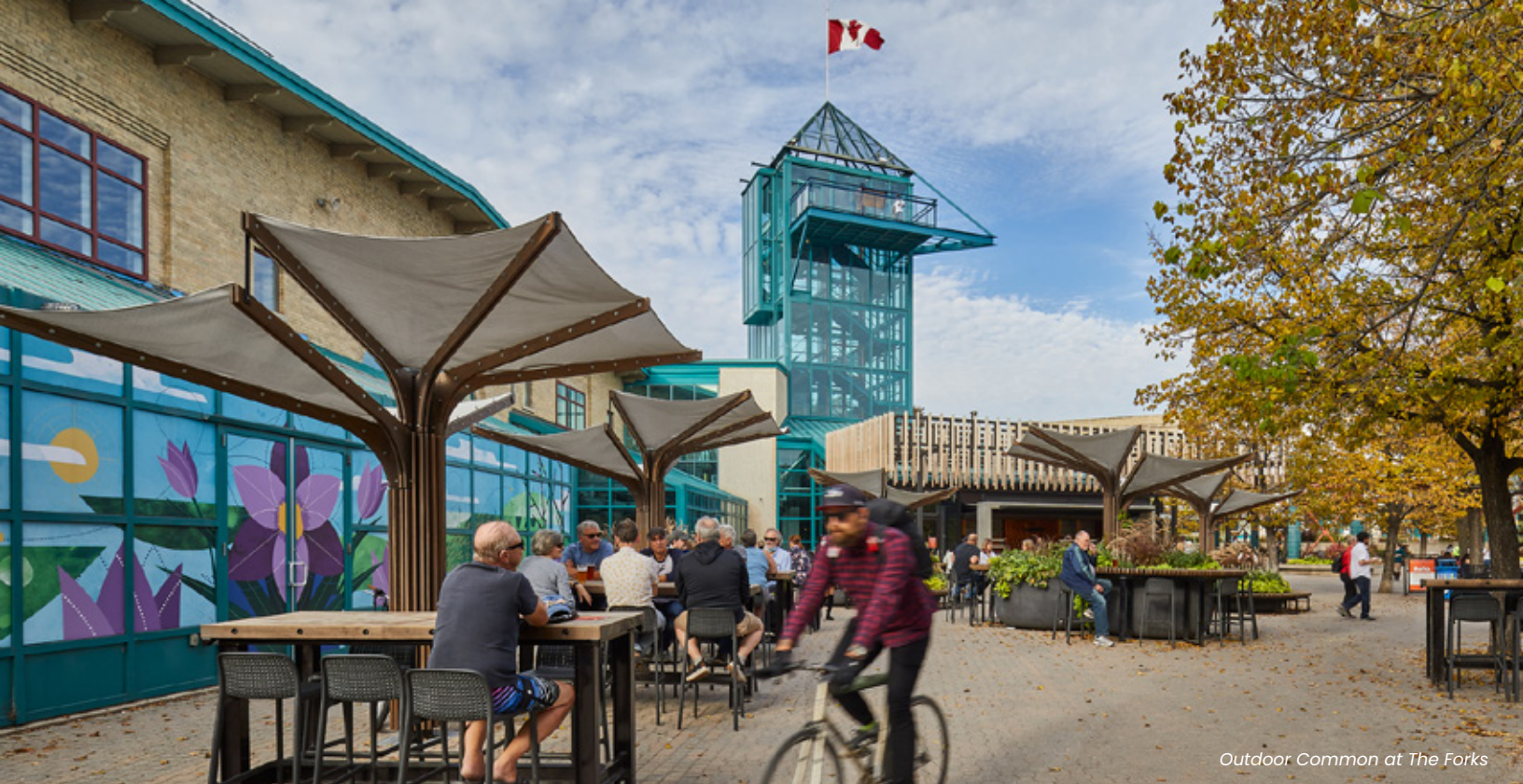
Outdoor Common at The Forks